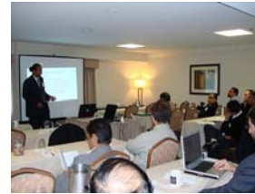
Himalayan Policy Research Conference—Madison