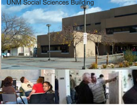
Students in the Center