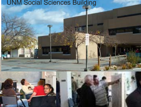
Students in the Center