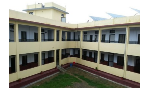
PNMF's college campus